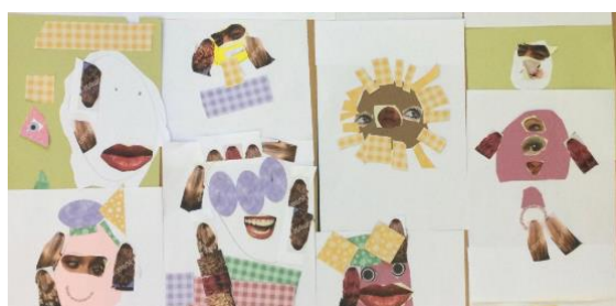
Reception's Picasso style faces