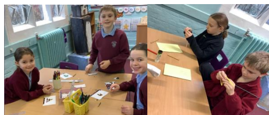
Year 3/4's quilling and mosaic work

This week the children have been enjoying an Art themed week. During the afternoon sessions the children have been developing their skills in collage and mosaic work. It has been lovely to see the range of skills being developed across the school.