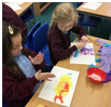
Year 1/2 's Eric Carle style animal collage.