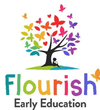
Flourish Early Education