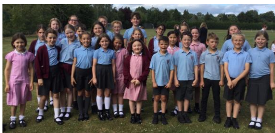
KS2 Choir attending the choral day at Stafford Grammar.